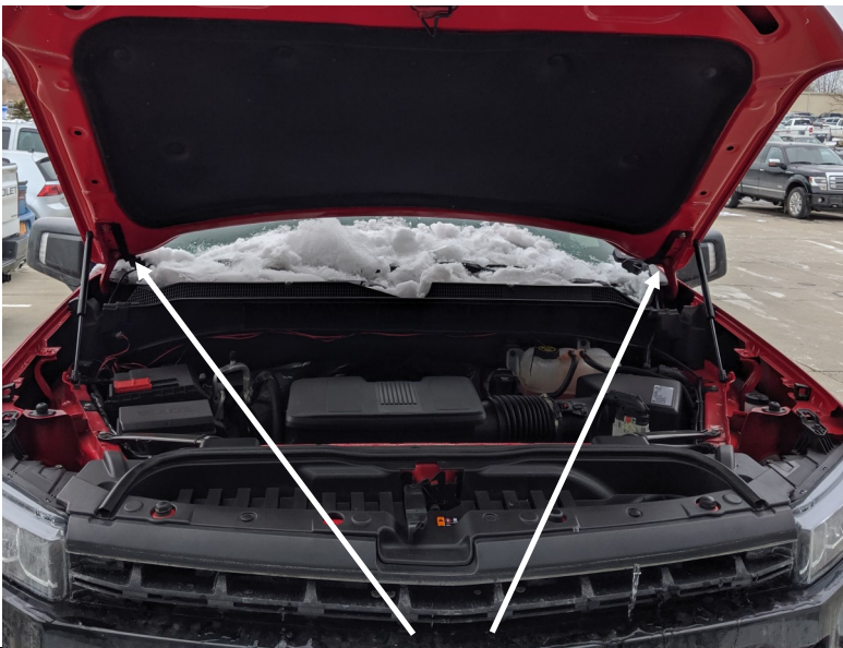
Figure 1a: Bracket Locations

The brackets are designed to utilize the factory mounting locations for the hood hinge. These locations are shown in Figure 1a .