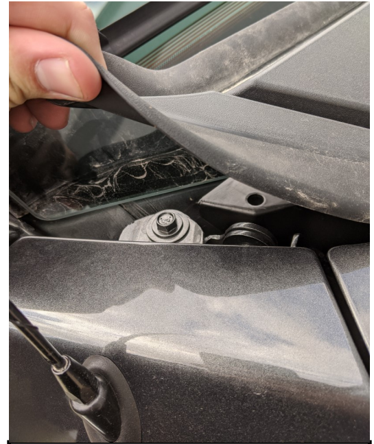
Figure 2: Fender Bolt Location