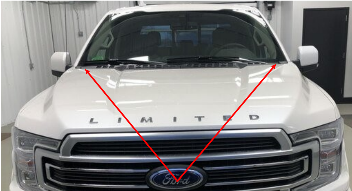
Figure 1: Bracket Locations

The brackets are designed to utilize the factory mounting locations for the front fender. These locations are shown in Figure 1 .