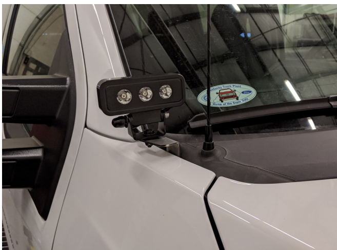
Figure 5: Putco 10007 Installed