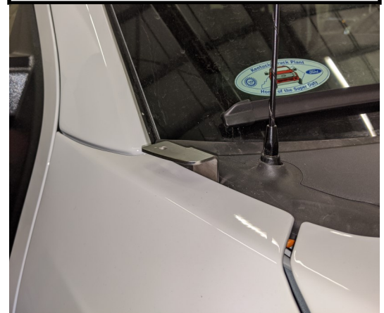
Figure 3: Bracket Orientation