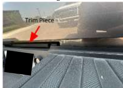
Figure 1. Trim Piece Location