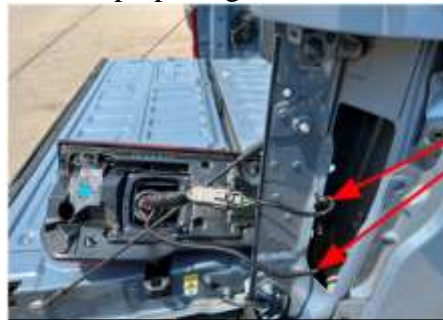
Figure 8. Tail Lamp Reassembly