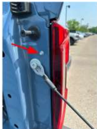
Figure 5. Tail Lamp Removal