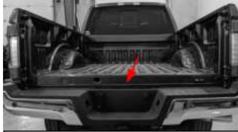
Figure 3. Blade Installation Location